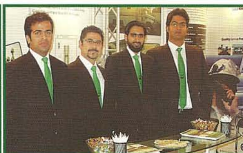
Young and talented team of ETS representing the Company at Mini Oil Show ATC- 2013