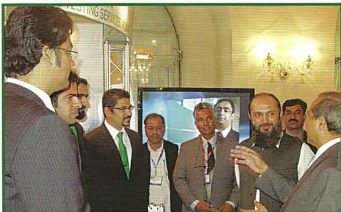
Mr. Jam Kamal Khan (Minister of State for Petroleum & Natural Resources) at ETS Booth