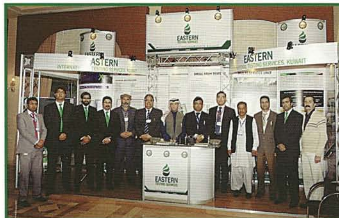
Group photo of ETS representative at Mini Oil Show ATC 2013