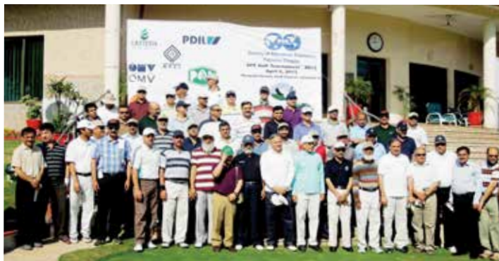
Participants of SPE Golf Tournament held on April 06, 2013