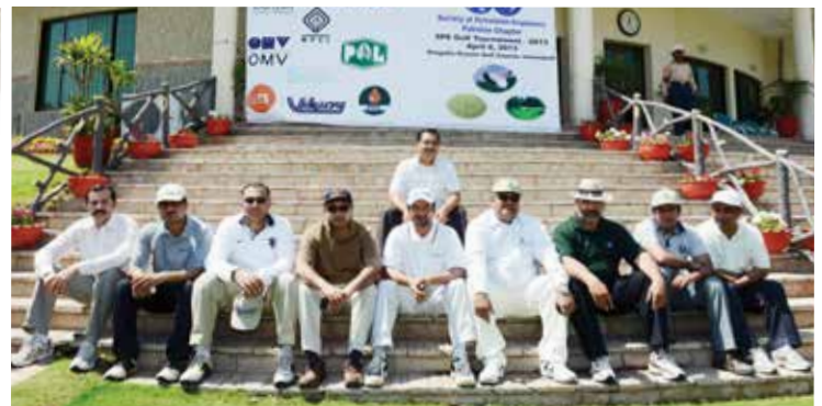
ETS Group Photograph at SPE Golf Tournament 2013