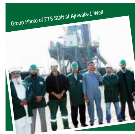
Group Photo of ETS Staff at Ajuwala-1 Well