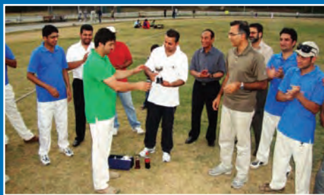
Friendly cricket matches played among the ETS departments