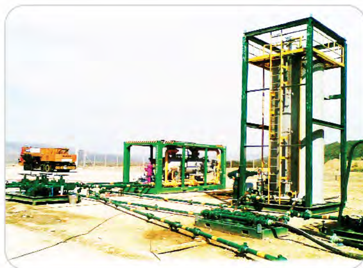
Upon arrival in Pakistan, the HP Separator was successfully used on 9 wells in North of Pakistan