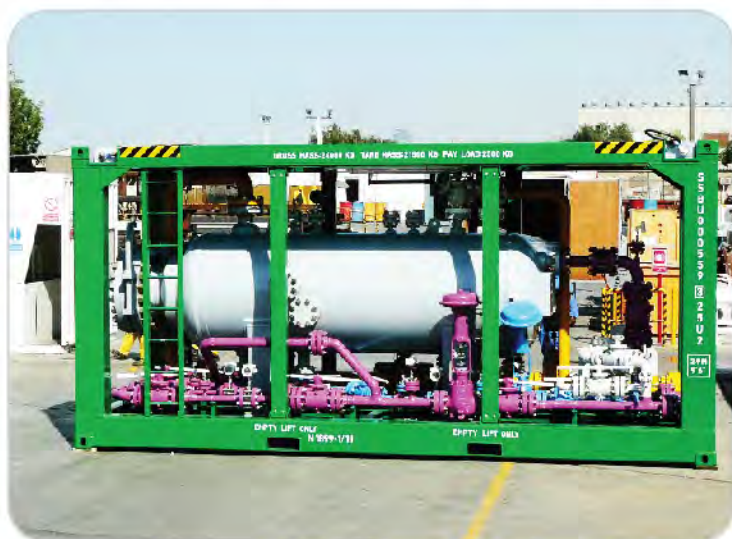
ETS has introduced the 2160 PSI HP Separator first time in Pakistan

In Pakistan production testing is carried out using conventional 1440 PSI separator and implementing zero flaring concepts. There are certain limitations associated with the conventional 1440 PSI separators available in Pakistan. Eastern Testing Service (Private) Limited came with a solution to the limitations and introduced the first ever High Pressure (HP) Separator in Pakistan. This Separator has overcome all the limitations due to its high design pressure of 2160 PSI and high gas and oil flow rate capacity which in 90 MMSCFD and 13000 BPD respectively.