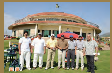
Eastern Testing Services (Private) Limited co-sponsored and participated in SPE Golf Tournament 2012 held on April 21, 2012