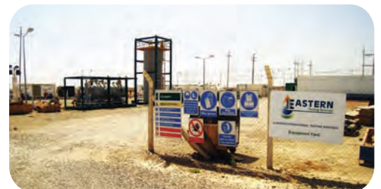
EITS successful projects in Iraq 2011-12