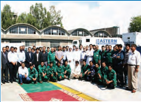
Annual Employees Reward Ceremony - April 2011 and May 2012