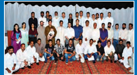
Family Iftar Dinner - August 2011