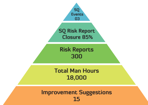
Services Quality 2011 / 2012